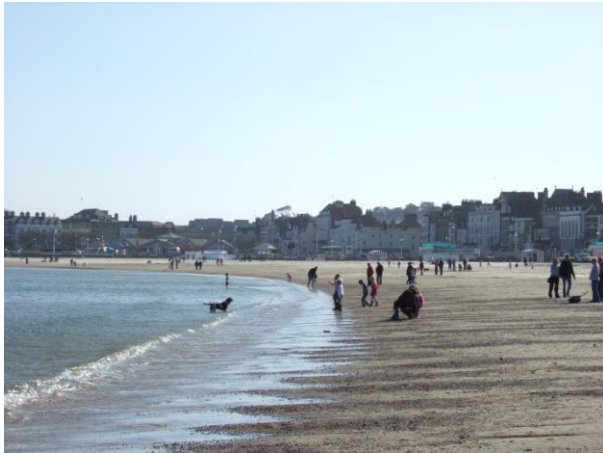
Weymouth Beach.

Much of the coastal development is relatively recent and it started with the sudden popularity of spa towns and sea-bathing resorts. Weymouth in the late 18th century and Bournemouth in the mid 19th century underwent rapid growth, as hotels, tea-rooms and other attractions were built to cater for new, wealthy visitors. In the late 19th and early 20th centuries, the introduction of the railways, and an increase in leisure with the advent of paid leave meant that holidays by the sea suddenly became available to the masses. Towns with beaches rapidly turned into resorts.