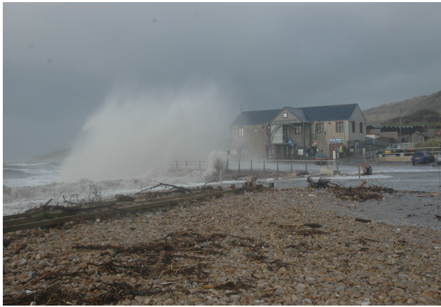
Charmouth Heritage Centre in Storm.