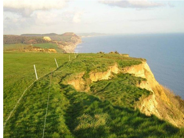
Coastal erosion at Timber Hill.

There is now a growing presumption that for the open coast, 'No Active Intervention' will be the preferred policy so that natural erosional processes are allowed to progress unhindered; unless there is an overriding social or economic reason to intervene.